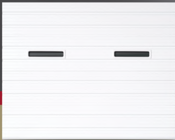
9' x 7' 3242 white with optional 24" x 6" windows.