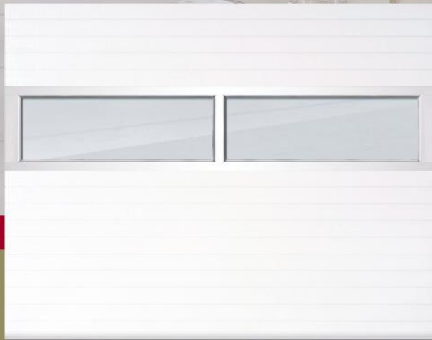
9' x 7' 3285 white with optional clear anodized aluminum full-view window section.